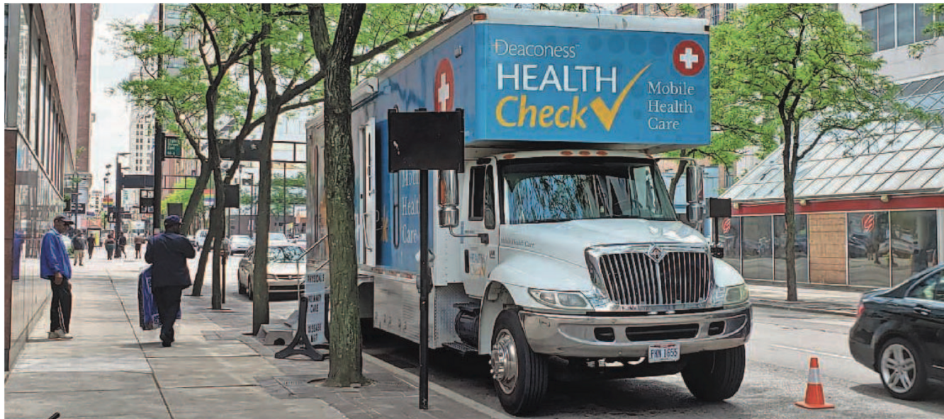
The Deaconess Health Check mobile van makes a regular stop at the downtown Cincinnati library.